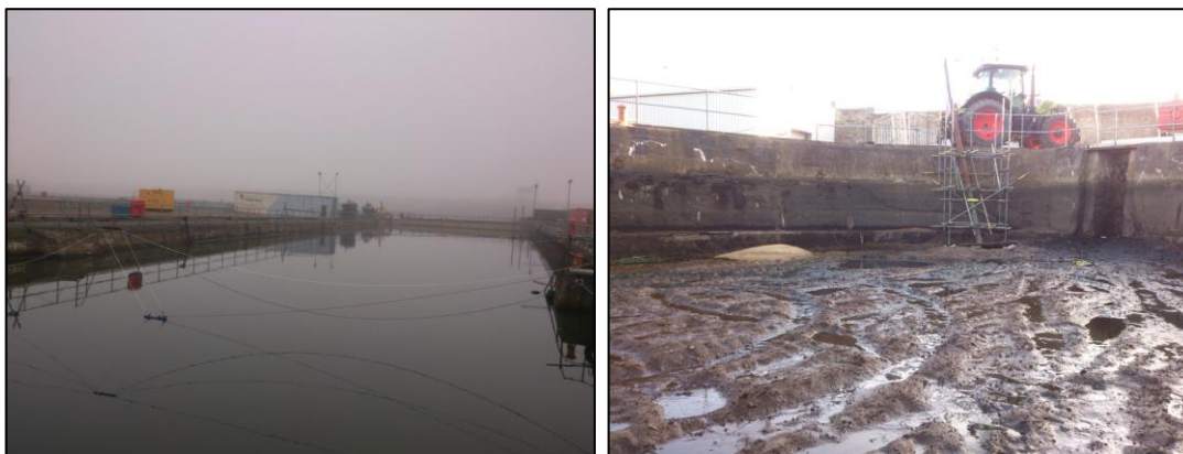
Figure 1. Left- Semi-field experiments were undertaken in a large enclosed dock at OREC Catapult field site, Blyth; Right- the drained dock showing the small-scale pile-driving operation at one end.

(ADInstrument Powerlab module) with associated software (CHART 5.5). Water-borne particle motion and pressure were also measured simultaneously (HiTech HTI-96-MIN hydrophone, sensitivity -164.3 dB re 1V/mPa; tri-axial accelerometer, M20L Geospectrum Technologies; Boss recorder BR-800). The sound and vibration data were used to calculate RMS of ambient levels (RMS, \text{m s}^{-1} ) and peak amplitude of the pile strikes (10 strikes, \text{m s}^{-1} ), in addition to spectra (Blackman, FFTs 1024).